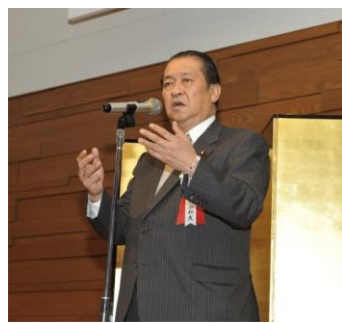
[Above] Mr. K. Hatoyama, a Member of the House of Representatives and former Minister of State for Interior (Local Autonomy and Telecommunication), Minister of State for Education, and one of the conveners of the reception